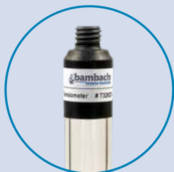
Threaded connection GL14