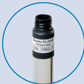
Threaded connection BL